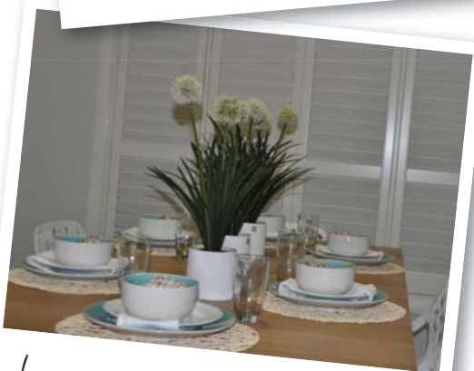
Impressive Design Range