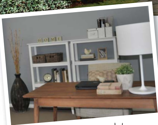
Value & Quality