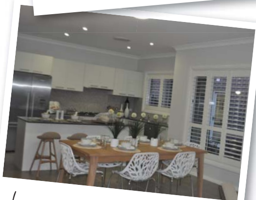
Impressive Design Range