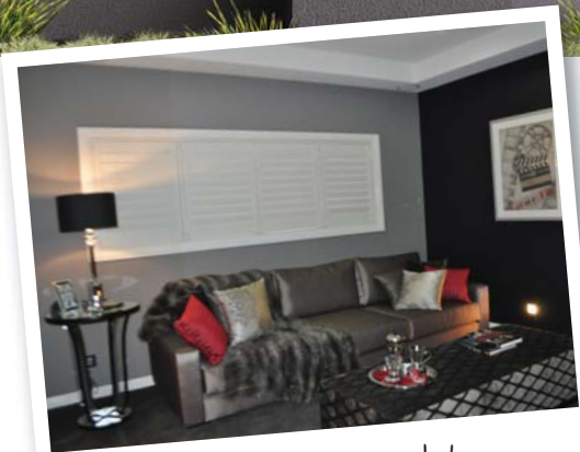
Value & Quality