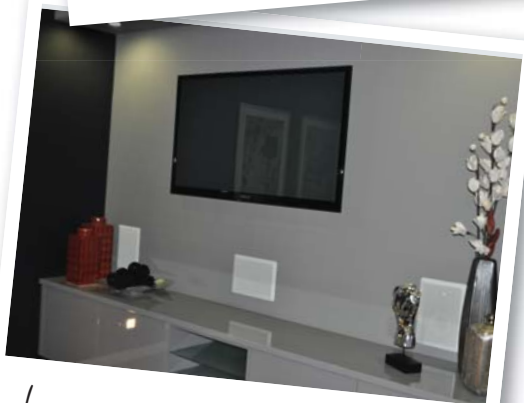
Impressive Design Range