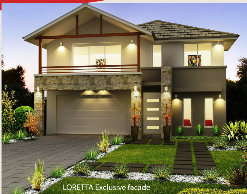
LORETTA Exclusive facade

Across the road from community facilities and swimming pool.