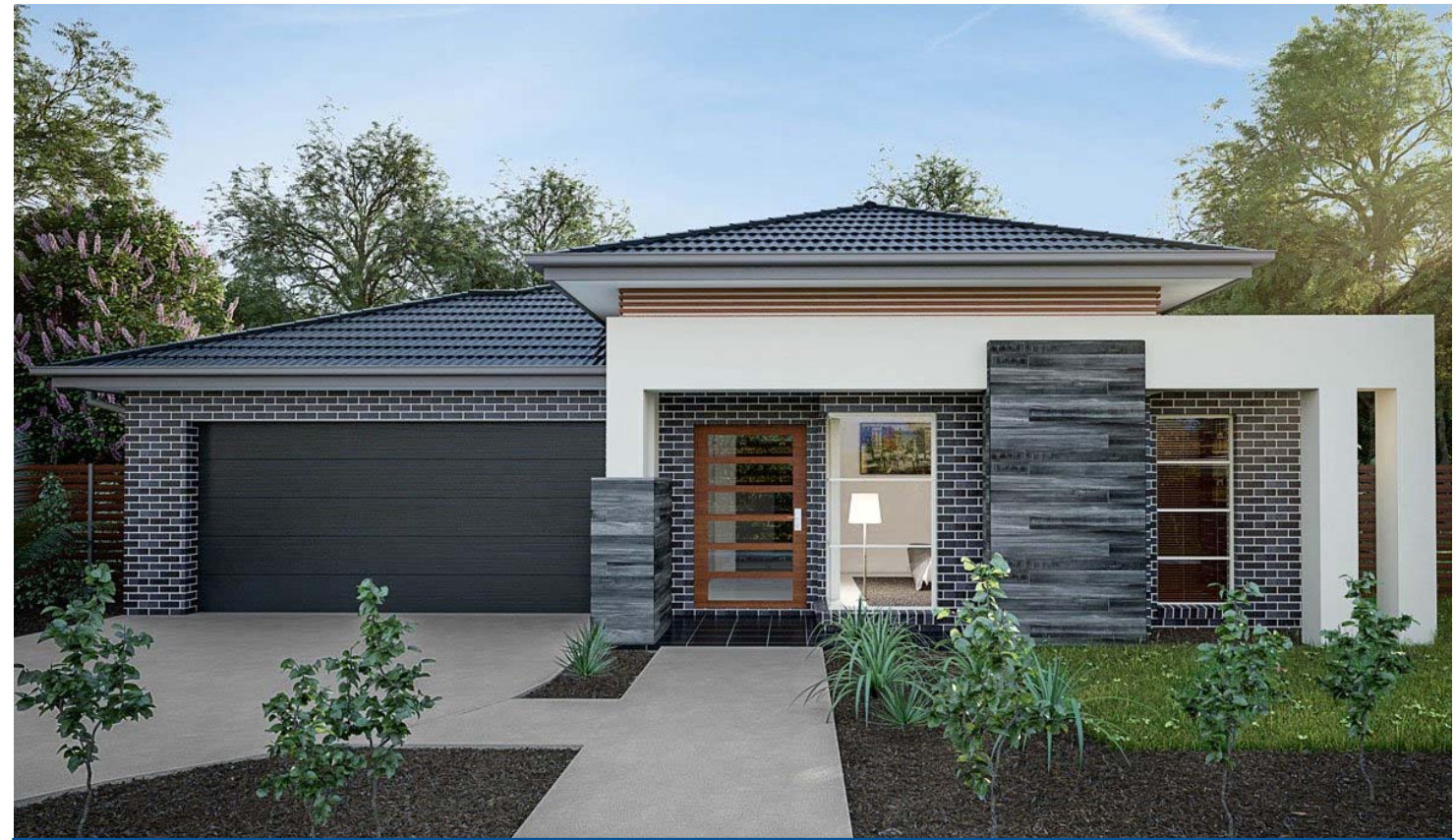
SOUL 30 / DESTINY FAÇADE 4 BEDROOMS / 2 BATHROOMS / 2 CAR

LANDSCAPING PACKAGE & SITE COSTS INCLUDED